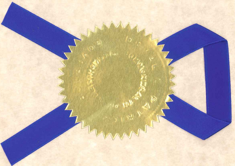
WILLIAM FRANCIS GALVIN SECRETARY OF THE COMMONWEALTH