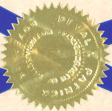
WILLIAM FRANCIS GALVIN SECRETARY OF THE COMMONWEALTH

God Save the Commonwealth of Massachusetts