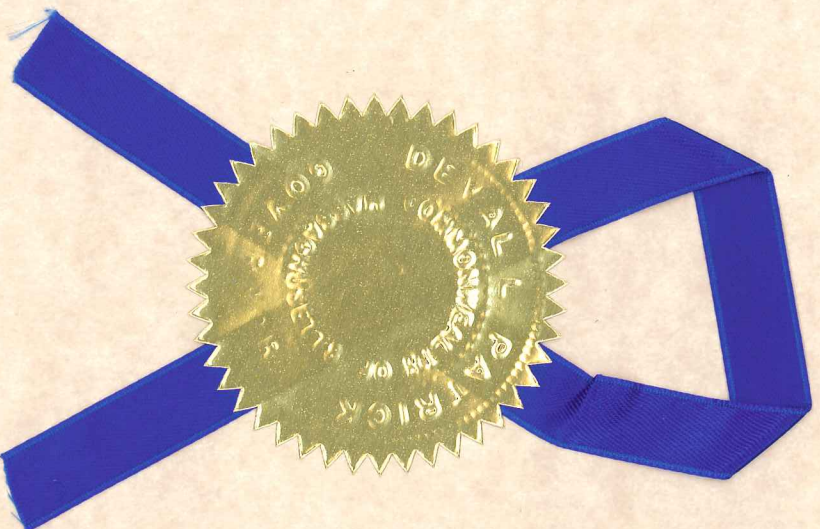
DEVAL L. PATRICK GOVERNOR OF THE COMMONWEALTH

WILLIAM FRANCIS GALVIN SECRETARY OF THE COMMONWEALTH