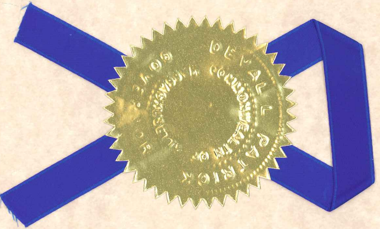
WILLIAM FRANCIS GALVIN SECRETARY OF THE COMMONWEALTH

God Save the Commonwealth of Massachusetts