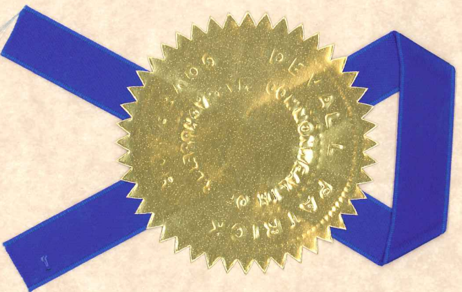
WILLIAM FRANCIS GALVIN SECRETARY OF THE COMMONWEALTH

God Save the Commonwealth of Massachusetts