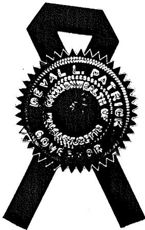
WILLIAM FRANCIS GALVIN SECRETARY OF THE COMMONWEALTH

God Save the Commonwealth of Massachusetts