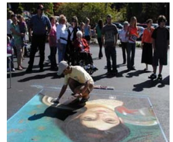
Below: A scene from the Lakeville Arts & Music Festival.