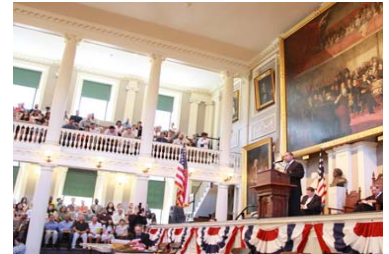
Governor Patrick announces the launching the New Americans Initiative during a naturalization ceremony at Boston's Faneuil Hall.

For more information about the public workshops and the upcoming Strategic Transportation Plan, contact Katherine Fichter of the Executive Office of Transportation at katherine.fichter@eot.state.ma.us .