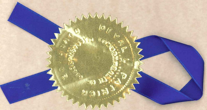
WILLIAM FRANCIS GALVIN SECRETARY OF THE COMMONWEALTH