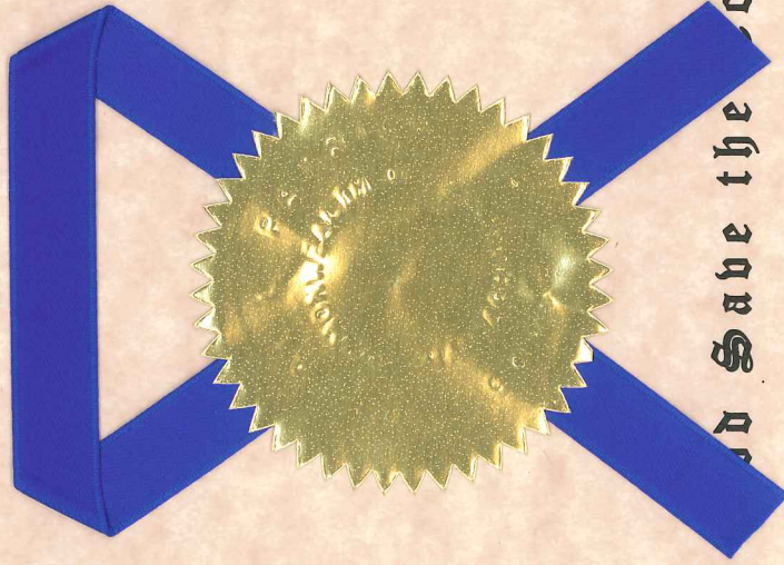
DEVAL L. PATRICK GOVERNOR OF THE COMMONWEALTH