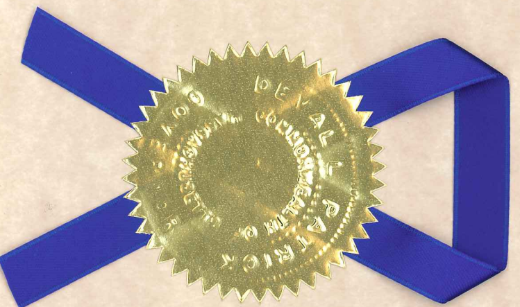
WILLIAM FRANCIS GALVIN SECRETARY OF THE COMMONWEALTH

God Save the Commonwealth of Massachusetts