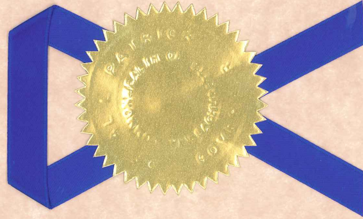
DEVAL L. PATRICK GOVERNOR OF THE COMMONWEALTH