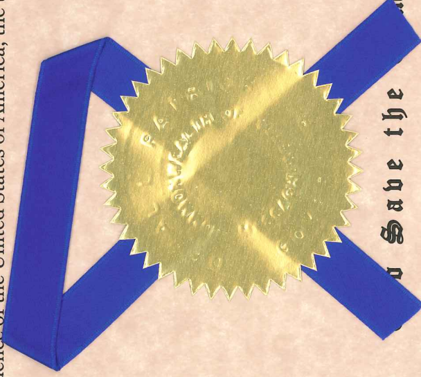
WILLIAM FRANCIS GALVIN SECRETARY OF THE COMMONWEALTH