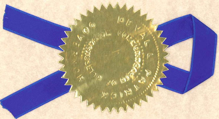
WILLIAM FRANCIS GALVIN SECRETARY OF THE COMMONWEALTH