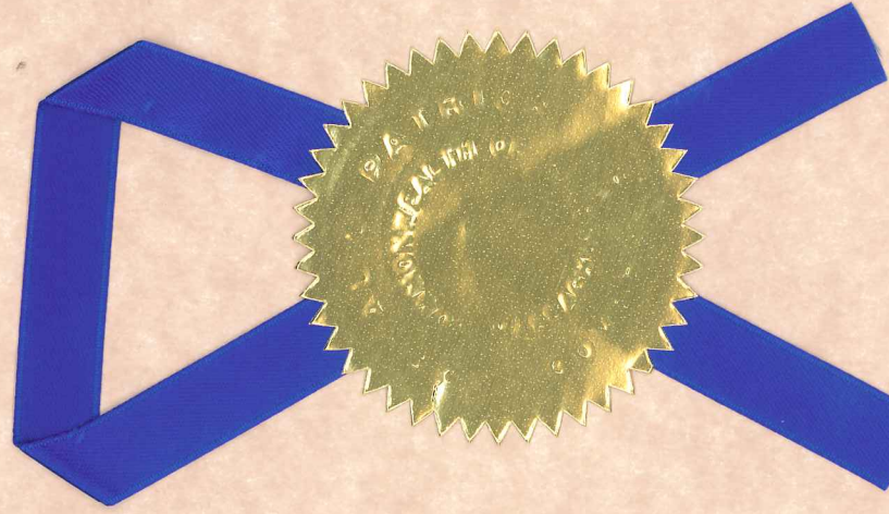
DEVAL L. PATRICK GOVERNOR OF THE COMMONWEALTH