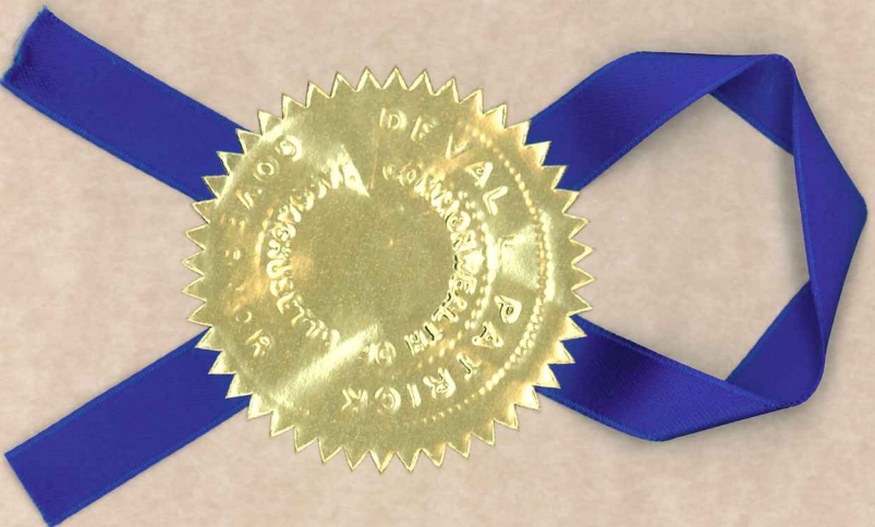
WILLIAM FRANCIS GALVIN SECRETARY OF THE COMMONWEALTH

God Save the Commonwealth of Massachusetts