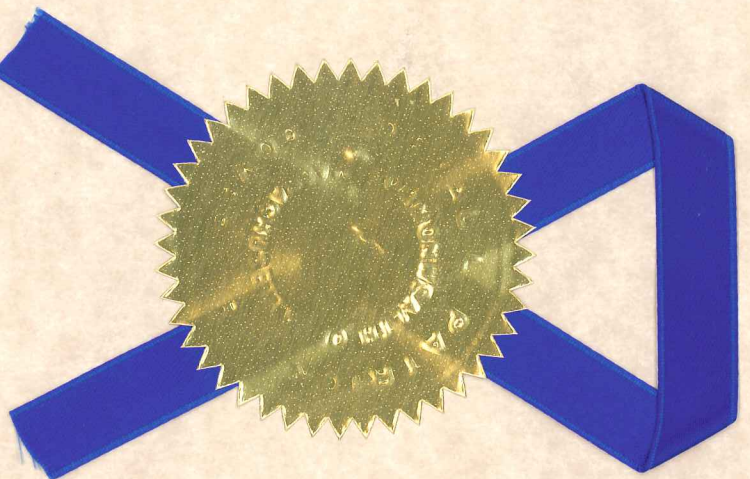
WILLIAM FRANCIS GALVIN SECRETARY OF THE COMMONWEALTH

God Save the Commonwealth of Massachusetts