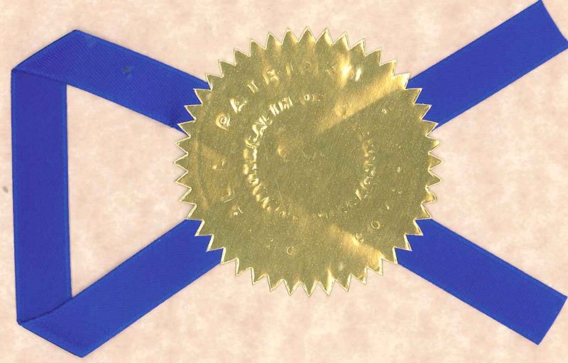
WILLIAM FRANCIS GALVIN SECRETARY OF THE COMMONWEALTH

God Save the Commonwealth of Massachusetts