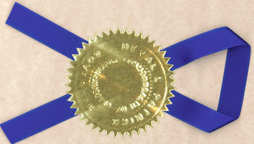
WILLIAM FRANCIS GALVIN SECRETARY OF THE COMMONWEALTH