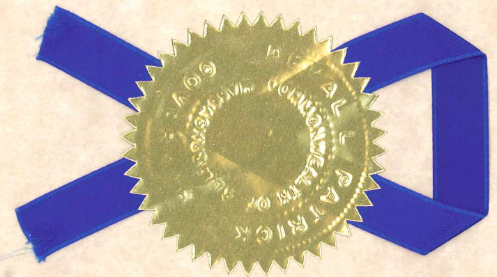
DEVAL L. PATRICK GOVERNOR OF THE COMMONWEALTH

WILLIAM FRANCIS GALVIN SECRETARY OF THE COMMONWEALTH