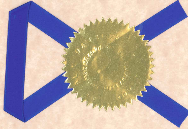
DEVAL L. PATRICK GOVERNOR OF THE COMMONWEALTH