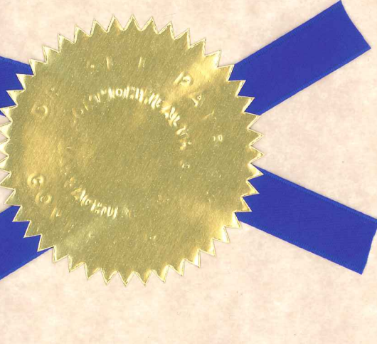
DEVAL L. PATRICK GOVERNOR OF THE COMMONWEALTH