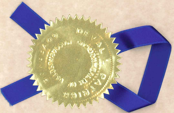
DEVAL L. PATRICK GOVERNOR OF THE COMMONWEALTH

WILLIAM FRANCIS GALVIN SECRETARY OF THE COMMONWEALTH