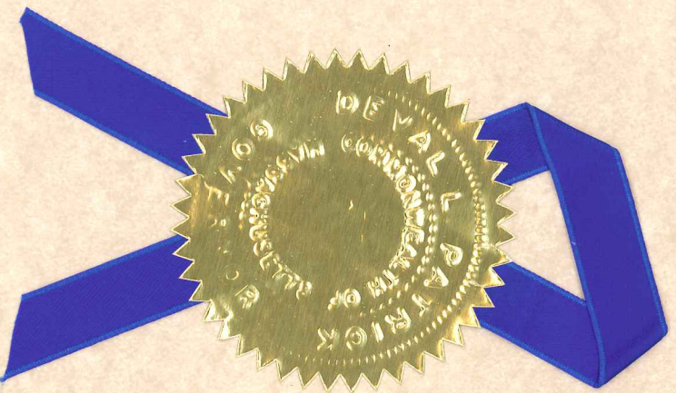
WILLIAM FRANCIS GALVIN SECRETARY OF THE COMMONWEALTH