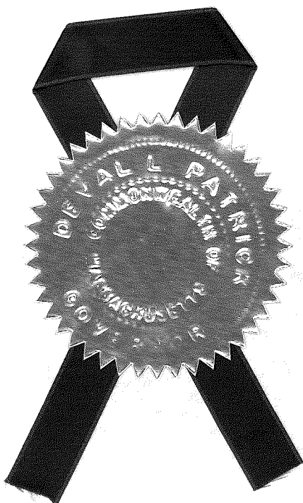
WILLIAM FRANCIS GALVIN SECRETARY OF THE COMMONWEALTH

God Save the Commonwealth of Massachusetts