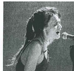
Fiona Apple played the Capitol Theatre, her first of many upcoming NYC-area shows (pics)