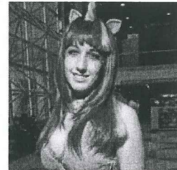
New York Comic Con 2012 photos (Cosplay enthusiasts, King Hippo, superheroes, Walking Dead, Cobra Commander & more)

Anonymous wrote: Yeah 20 dollars gets you 12 songs you have to pay 800 dollars to se... [more]