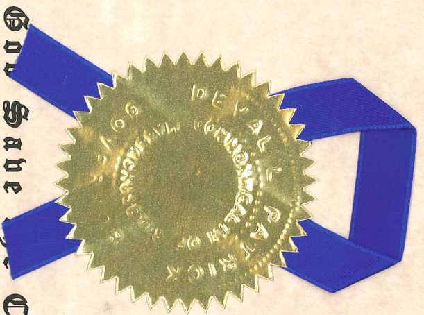
WILLIAM FRANCIS GALVIN SECRETARY OF THE COMMONWEALTH

God Save the Commonwealth of Massachusetts