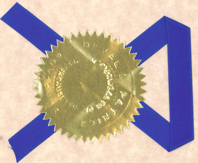
WILLIAM FRANCIS GALVIN SECRETARY OF THE COMMONWEALTH

God Save the Commonwealth of Massachusetts