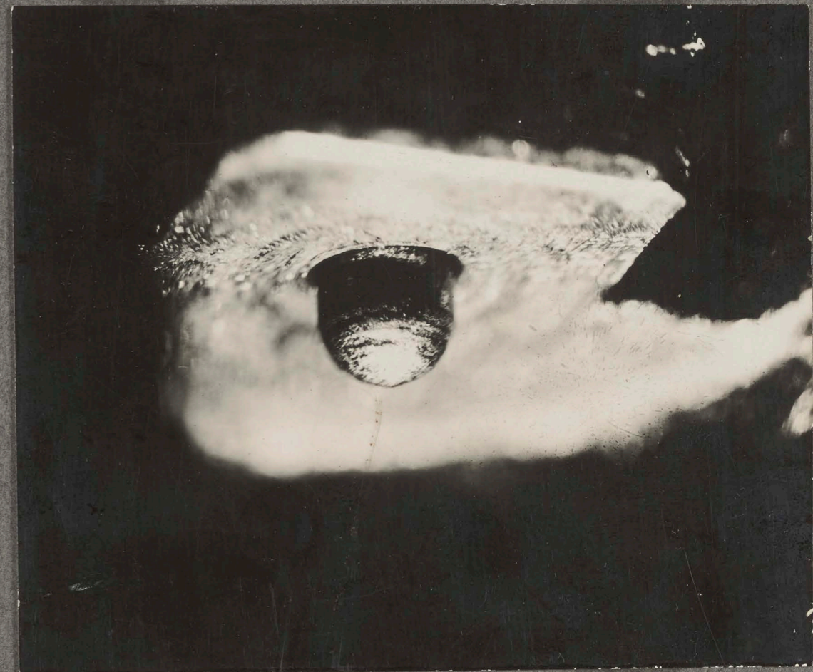
EXHIBIT - A FIRING PIN, S&W - PISTOL.

OFFICE OF CLERK OF COURTS NORFOLK COUNTY