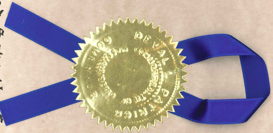
DEVAL L. PATRICK GOVERNOR OF THE COMMONWEALTH

A blue ink signature of William Francis Galvin, written in a cursive style.