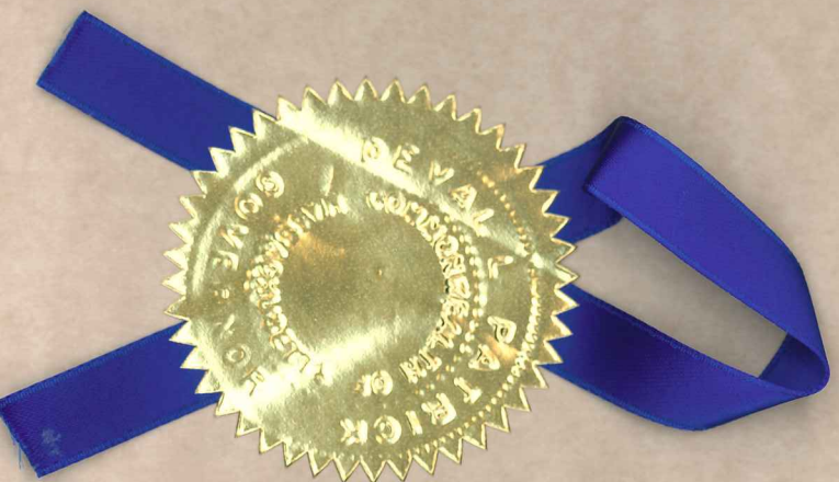
WILLIAM FRANCIS GALVIN SECRETARY OF THE COMMONWEALTH

God Save the Commonwealth of Massachusetts