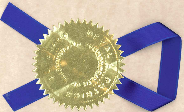
DEVAL L. PATRICK GOVERNOR OF THE COMMONWEALTH

WILLIAM FRANCIS GALVIN SECRETARY OF THE COMMONWEALTH