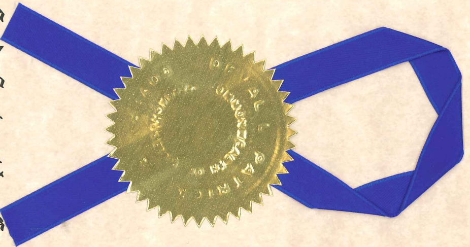
WILLIAM FRANCIS GALVIN SECRETARY OF THE COMMONWEALTH

God Save the Commonwealth of Massachusetts